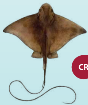
CR Common eagle ray Myliobatis aquila