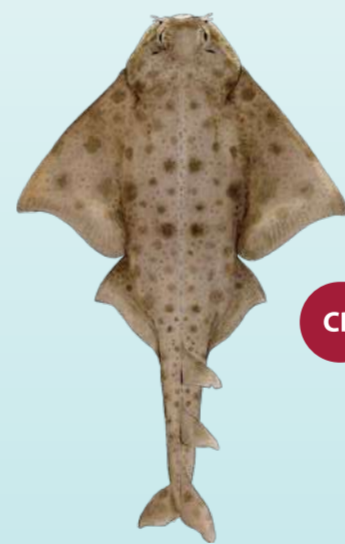
CR Sawback angelshark Squatina aculeata