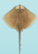
EN Twineye skate Raja ocellifera