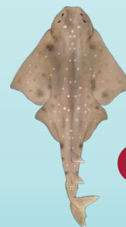
CR Smoothback angelshark Squatina oculata

Of the 88 species of chondrichthyans (sharks, skates, rays and ghost sharks) recorded in Namibian waters, 6 species are listed as Critically Endangered and 11 as Endangered on the IUCN Red List of Threatened Species.