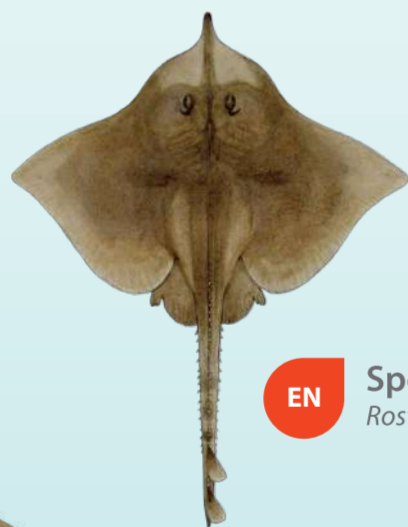
EN Spearnose / white skate Rostroraja alba