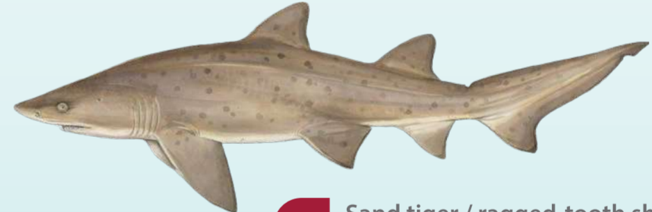
CR Sand tiger / ragged-tooth shark Carcharias taurus