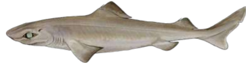
EN Gulper shark Centrophorus granulosus

Very high risk of imminent extinction in the wild.