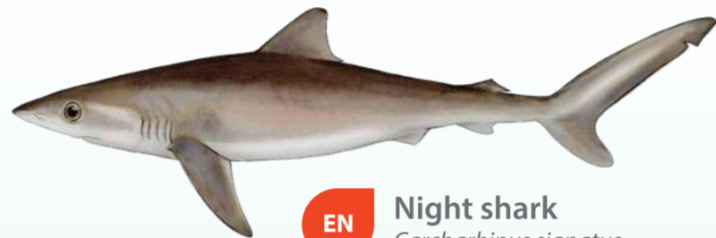
EN Night shark Carcharhinus signatus