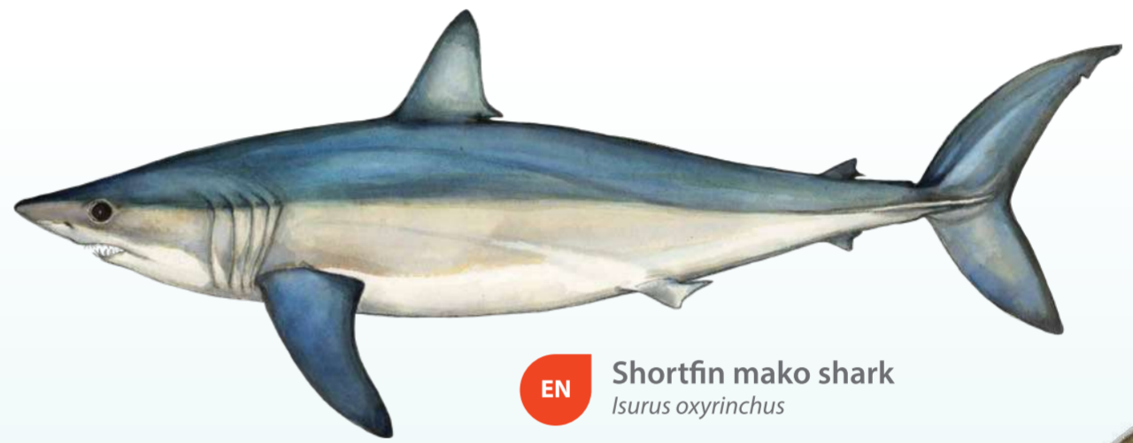
EN Shortfin mako shark Isurus oxyrinchus