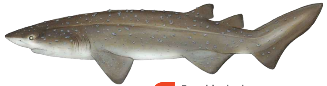
EN Bramble shark Echinorhinus brucus