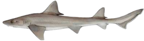
EN Smoothhound Mustelus mustelus