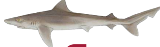
CR Tope / soupfin shark Galeorhinus galeus