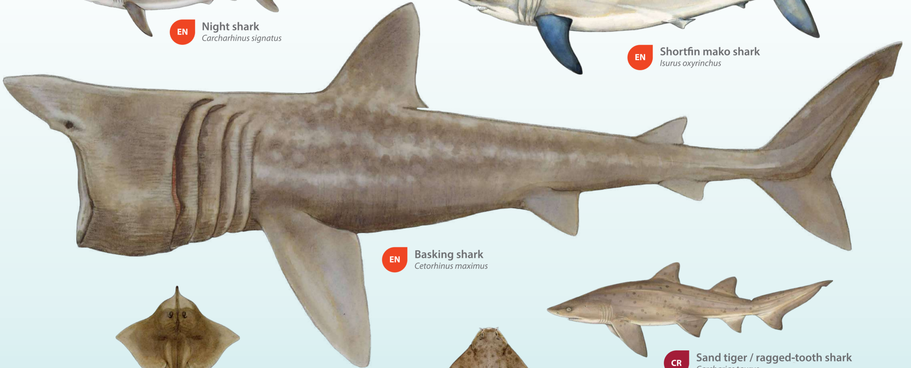
EN Basking shark Cetorhinus maximus