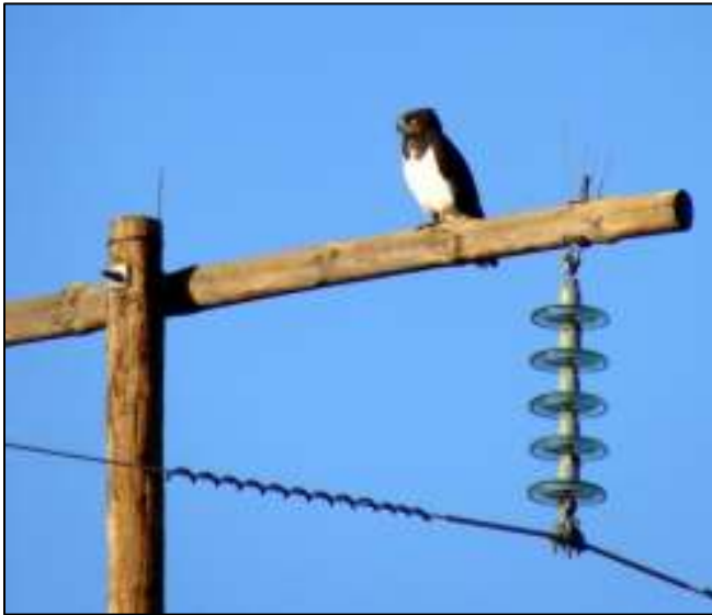
Black-chested Snake-eagle perched on the Stampriet/Aranos 66 kV line at farm Clave.

backed Vulture, Spotted Eagle Owl, Secretarybird, Brown Snake-eagle, White-breasted Cormorant as well as giraffe and small-spotted genet. There is a growing concern about the increasing number of collision incidents involving both Ludwig's Bustard (recently uplisted to Endangered ) and Kori Bustard, especially in the South. A special workshop was organized at Keetmanshoop in October 2010 in order to address this problem and draft an action plan (see p3 below). Repeated incidents of flamingo collisions on power lines crossing migration routes are also of concern, and funding is being sought for tracking the two flamingo species in order to determine their flight paths more accurately. At the same time, outages caused by nesting Sociable Weavers and Red-billed Buffalo-Weavers are a persistent and ongoing problem that results in much unnecessary expenditure by power suppliers.