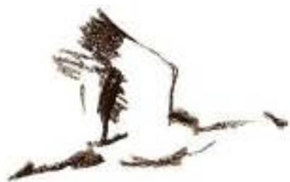
Ludwig's Bustard in flight (artwork Hermann Cloete).

*Note that all project workshop reports and newsletters are available on our website ( www.nnf.org.na/nampowerproject.htm ).