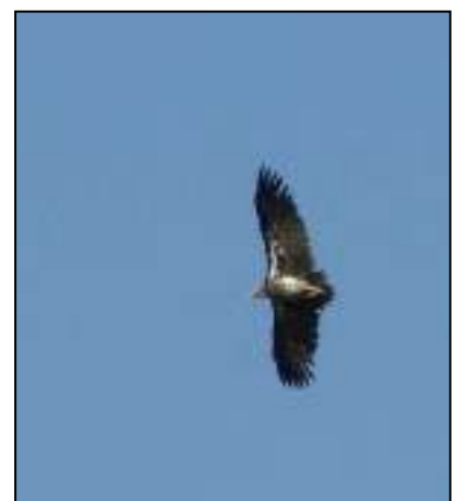
RIGHT Lappet-faced Vulture ( Swartaasvoël ) near the Stampriet/Aranos 66KV line at farm Kameelboom