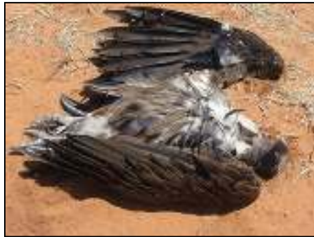
Top: The first vulture collided midspan on the Kiris 33 kV retic. near Aroab (see p11).