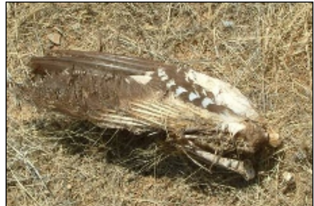
Mortalities on the Kokerboom-Aries 400 kV line survey included a Kori Bustard (adult female; above) and an unidentified bustard (below; photos Ann Scott).