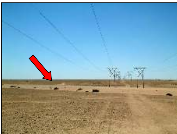
Structure of the 66 kV line with wooden poles and three large conductor wires, east of Walmund S/S. In this typical coastal desert habitat, dry water courses (red arrow) may be used as flight paths by nocturnally flying species such as flamingos, where power lines would be a potential collision threat.