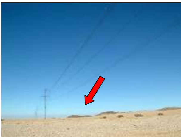
Top: Google image of the Ganab area investigated (green markers; 220 kV line = pink ); roads are yellow (based on a Google map generated by Alice Jarvis [EIS].