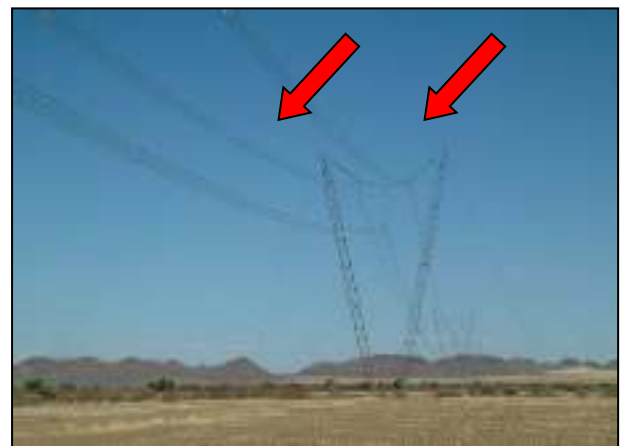
Structure of the 400 kV Kokerboom-Aries line; near-invisible earth wire and optic cable are indicated by arrows.

The area has a high potential for wildlife/power line interactions due to the convergence of several power lines, dry watercourses and strong winds experienced. Problems have been recorded previously in the same area on 10/11/09 (three carcasses) and 19/11/09 (five carcasses). The habitat is open with gravel; sparse grass and some bush. More bushy in the (dry) watercourse running NW to SE; windmill and stock water point nearby.