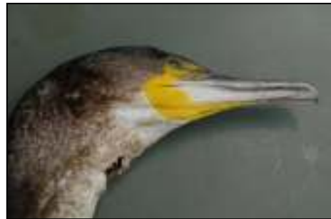
Top: Site of collision of a juvenile White-breasted Cormorant on a 11 kV line near Tsumeb;