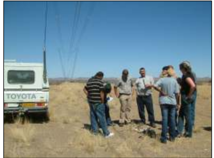
Concerned participants at the Bustard and Power Lines Workshop at Keetmanshoop in October 2010 examine the remains of a Black-chested Snake-eagle that had collided with the Kokerboom-Aries 400 kV line.

Based on a comprehensive information gathering and research programme, the mission of the partnership is, ultimately, to develop a comprehensive biodiversity information resource – initially focussing on birds – that will assist NamPower, regional electricity distributors (REDs) and all other environmental and industry role players in Namibia to manage power line impacts on the natural environment and vice versa .