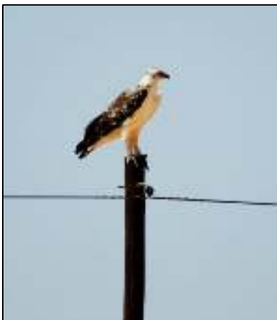
LEFT Juvenile Martial Eagle ( Breëkoparend ) just outside Langer Heinrich Mine at Arandis on 9/12/10

Continue to promote awareness about the problem and reporting method to NamPower staff and other stakeholders, especially the farming community and power CCs.