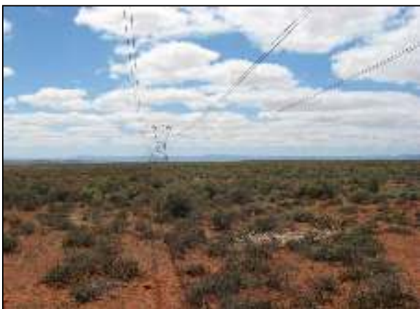
The collision hotspot from Jessica's last survey: unfortunately there were mostly only feathers left but three feather "sprays" can be seen.

On my October 2010 survey of transmission power lines in the Karoo, I recovered a huge number of Ludwig's Bustard mortalities on one section of the 400kV Helios-Juno line. In three months, at least 34 bustards died in just 20 spans, which highlights their extreme vulnerability to collision. The section is on top of a ridge, and has a few broken old-style flappers on one earth wire, so has clearly been a problem in the past. While the bustard numbers in the area have been high in the last few months, it is still an exceptionally high collision toll, and is a minimum estimate – most remains had been completely scavenged so it is probable that we didn't count all birds that died.