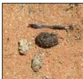
Large, unidentified pellets found beneath tower